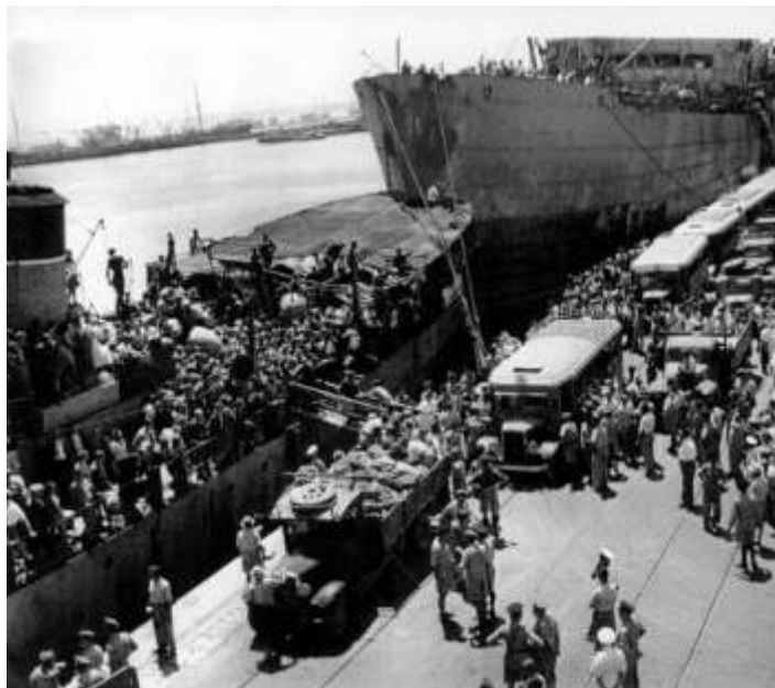
Disembarking from the "Wedgwood" at Haifa