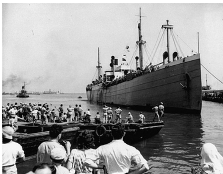
5 July 1948, the Komemiut (Pan York) bringing released inmates from the Cyprus detention camps to Haifa