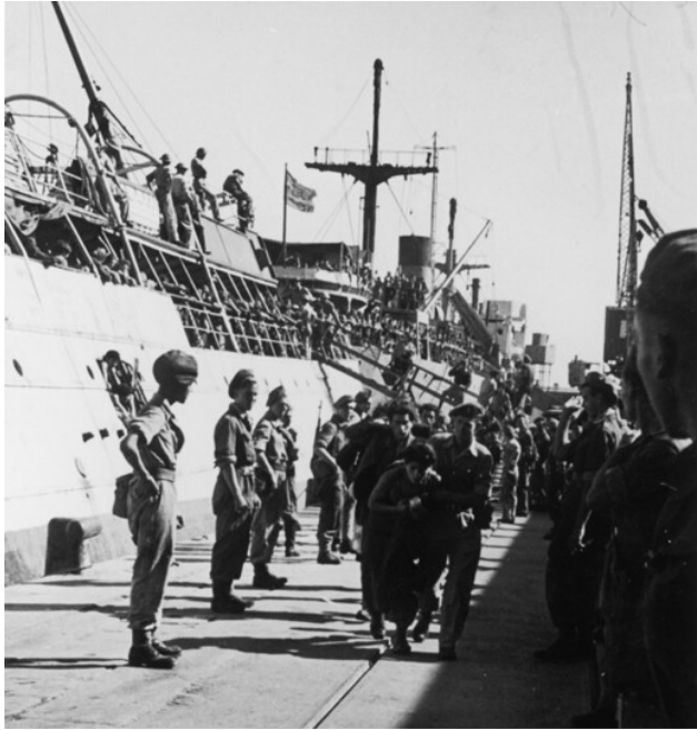
Disembarking the "Latrun" in Haifa