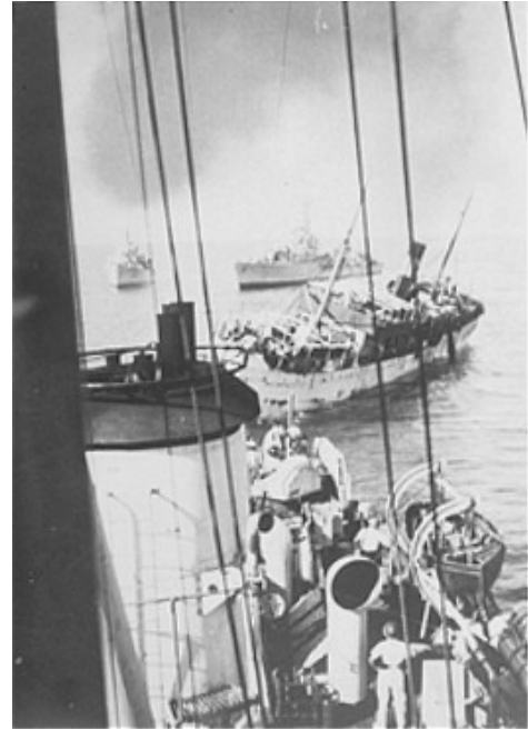
The "Latrun" surrounded by British destroyers