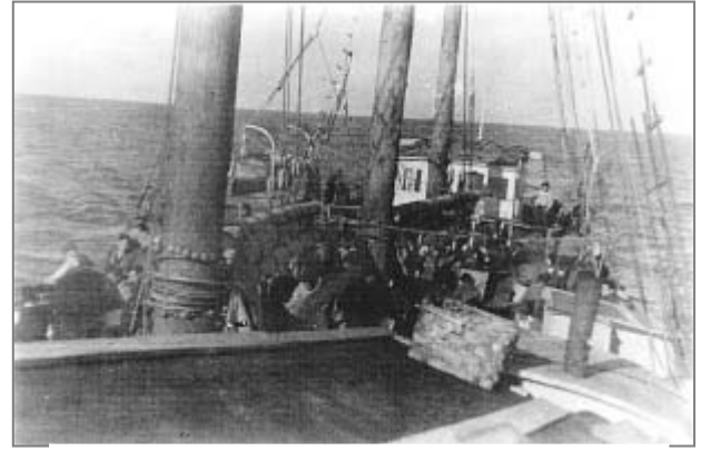
On board the "zibale" (photo by Ephraim Meital, a 15 year old Ma'apil)