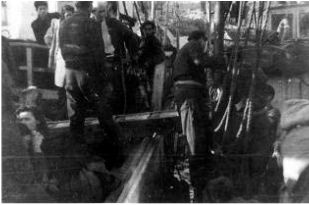
Transferring Ma'apilim at sea from the "Zibale" to the "Kaf Tet BeNovember"