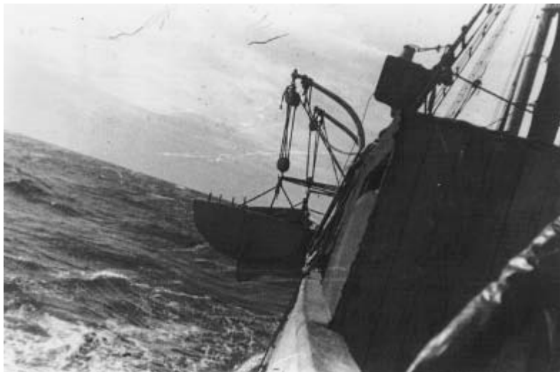
On board “Kaf Tet BeNovember” during a storm