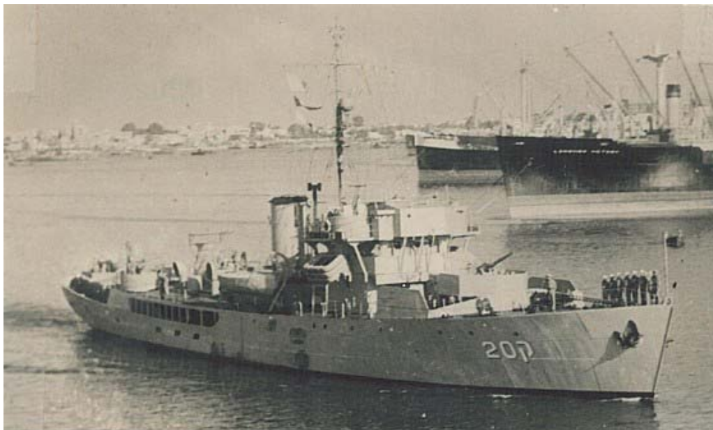
The Israeli Navy "Hagana K-20"