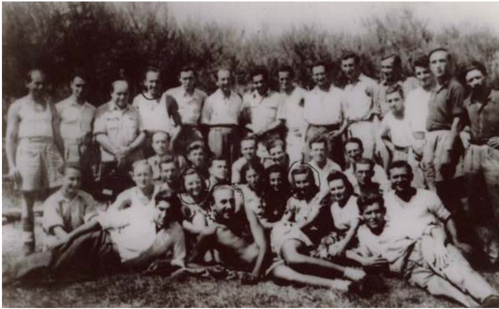
Immigrants of the Dalin posing for a group photo