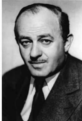
Ben Hecht 1