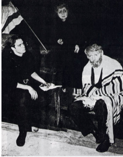
Marlon Brando, Celia Adler, Paul Muni

"A Flag Is Born was a play promoting the creation of a Jewish State in the ancient land of Israel. It opened on Broadway on September 4, 1946. The cast included Paul Muni, Celia Adler and Marlon Brando. Hollywood's most successful screenwriter, Ben Hecht was the playwright. It was directed by Luther Adler with music by Kurt Weill. It was produced by the American League for a Free Palestine, an organization headed by Hillel Kook, known in America by the anglicized name Peter Bergson.