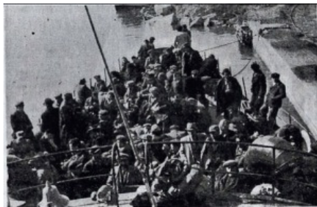
S.S. Ben Hecht shadowed by the British Navy