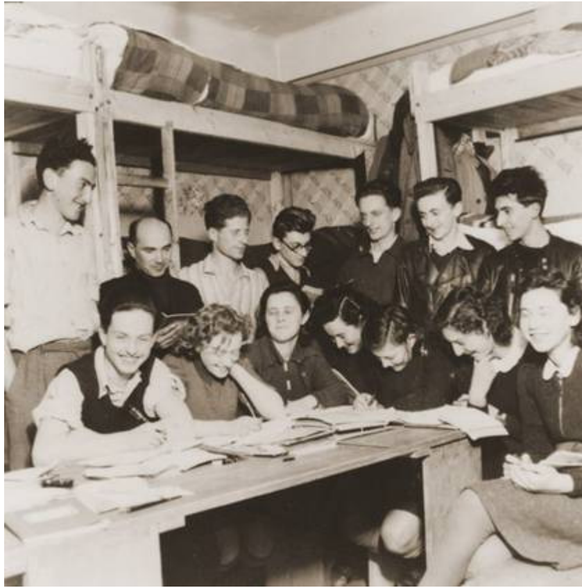
A youth group in Shavetz

After the German occupation all the people were imprisoned in a nearby concentration camp. In October 1941 all the men were taken to a field and shot dead. The women and a few children that remained behind were taken to a camp near Belgrade and from there on April-May 1941 put into "gas" trucks that went through the streets of Belgrade. Their bodies were thrown in some unknown field. As far as we know there were no survivors from the people that remained in Shavetz, except one couple that left just before the Germans came to Croatia and survived by chance in Italy. The remains of the men were moved to the Jewish Cemetery in Belgrade to a mass grave (The Memorial stone in the beginning of the film).